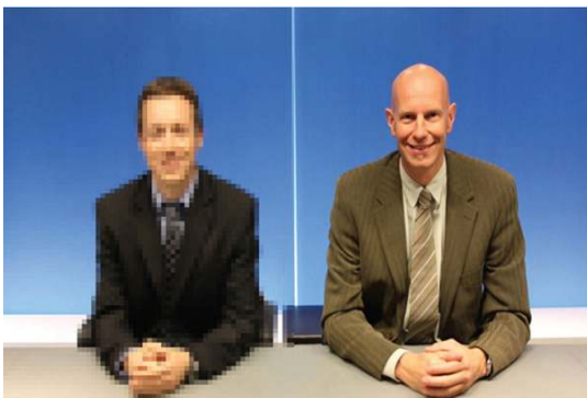
Figure 2. Comparison Without and With Cisco AM GW 3610

The Cisco TelePresence Advanced Media Gateway 3610 (Cisco® AM GW 3610) is a high-definition (HD) media gateway that enables businesses to get better value from their existing video and collaboration infrastructure. Combined with the Cisco TelePresence Video Communication Server (Cisco VCS), the Cisco AM GW 3610 is the first and most comprehensive network-centric solution that enables true HD communication between Microsoft Office Communications Server 2007 R2 and Microsoft Lync Server users and standards-based telepresence and video conferencing devices. Individuals and teams can now use familiar business tools to collaborate in high definition across the enterprise (Figures 1 and 2).