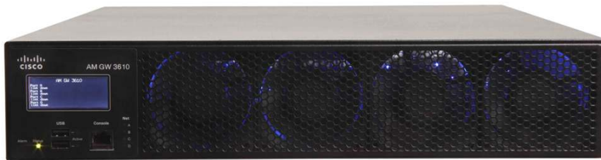
Figure 1. Cisco TelePresence Advanced Media Gateway 3610

The Cisco TelePresence® portfolio creates an immersive, face-to-face experience over the network, empowering you to collaborate with others like never before. Through a powerful combination of technologies and design that allows you and remote participants to feel as if you are all in the same room, the Cisco TelePresence portfolio has the potential to provide great productivity benefits and transform your business. Many organizations are already using it to control costs, make decisions faster, improve customer intimacy, scale scarce resources, and speed products to market.