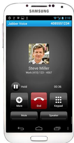
Figure 1. Cisco Jabber Voice for Android

Cisco Jabber Voice for Android is also one of the many Cisco Jabber clients providing unified communications on various platforms and devices. The Cisco Jabber Voice solution is one of several Cisco solutions for Android devices, such as Cisco WebEx® Meetings .