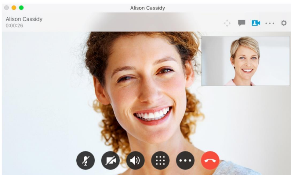
Figure 2. High-Definition Video with Integrated Audio Controls

The Cisco Jabber platform delivers business-quality voice and video to your desktop. Powered by the market-leading Cisco® Unified Communications Manager call-control solution, it is a soft phone with wideband and high-fidelity audio, standards-based high-definition video (720p), and desk phone control features. These features mean that high-quality and high-availability voice and video telephony is available at all locations and to users’ desk phones, soft clients, and mobile devices. The Cisco Jabber solution makes voice communications simple, clear, and reliable (Figure 2).