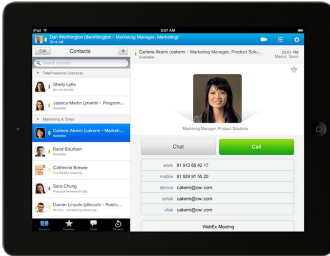
Figure 1. Cisco Jabber for iPad