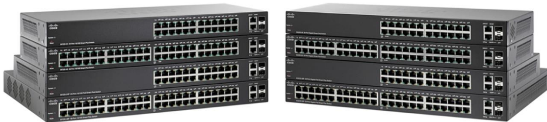
Figure 1. Cisco 220 Series Sw itches

For businesses requiring high performance, security, and manageability from network switches, fully managed switches are an excellent choice. However, they also typically come with high price tags. Smart switches are lower-priced alternatives, but performance and features are usually sacrificed. Cisco® 220 Series Smart Switches (see Figure 1) bridge the gap between managed and smart switches to offer you the best of both worlds. They provide the higher levels of security, management, and scalability that you expect from managed switches, while maintaining the affordability of smart switches.