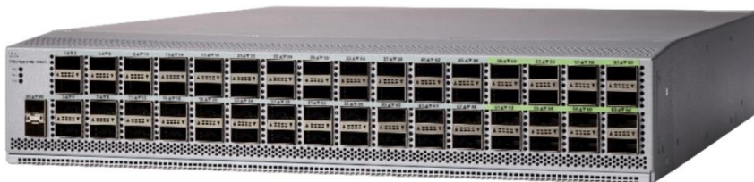
Figure 2. Cisco Nexus 9364C Switch

The Cisco Nexus 9364C ACI Spine Switch is a 2-Rack-Unit (2RU) spine switch for Cisco ACI that supports 12.84 Tbps of bandwidth and 4.3 bpps across 64 fixed 40/100G QSFP28 ports and 2 fixed 1/10G SFP+ ports(Figure 2). The last 16 ports marked in green support wire-rate MACsec encryption 1 .