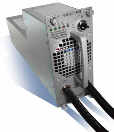
Figure 5. Cisco Nexus 7000 7.5kW AC Dual 30A Power Supply Module

The Cisco Nexus 7000 7.5kW AC Dual 30A Power Supply Module (Figure 5) delivers fault tolerance, high efficiency, load sharing, and hot-swap features to the Cisco Nexus 7000 Series. Each Cisco Nexus 7000 Series chassis can accommodate multiple power supplies, providing both chassis-level and facility power fault tolerance.