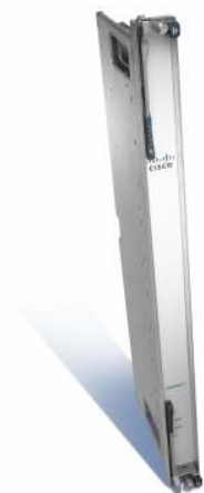
Figure 3. Cisco Nexus 7000 18-Slot Fabric Module with 46 Gbps per Slot

The Cisco Nexus 7000 18-Slot Fabric Module with 46Gbps per Slot (Figure 3) delivers the fault-tolerant fabric that provides parallel fabric channels to each I/O and supervisor module slot. Up to five simultaneously active fabric modules can work together, delivering 230 Gbps per slot of bandwidth.