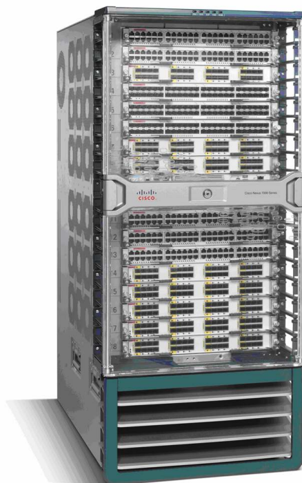
Figure 2. Cisco Nexus 7000 18-Slot Chassis

The 18-slot system supports front-accessed module slots with side-to-side airflow in a compact horizontal form factor with purpose-built integrated cable management to ease operations and reduce complexity.