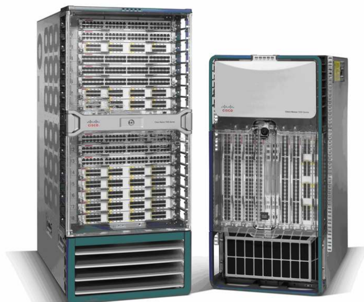
Figure 1. Cisco Nexus 7000 Series

The Cisco Nexus 7000 Series (Figure 1) provides integrated resilience combined with features optimized specifically for the data center for availability, reliability, scalability, and ease of management.