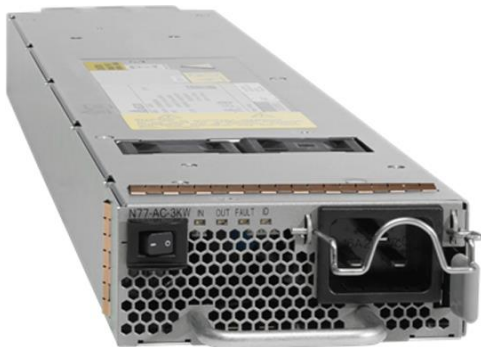
Figure 1. Cisco Nexus 7700 3.0-kW AC Power Supply Module

The power supplies are fully hot swappable, helping ensure no system interruption during installation or upgrades. They are fitted at the bottom front of the Cisco Nexus 7700 chassis, allowing installation and removal without disturbing the network cabling of the I/O modules.