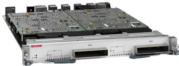
Figure 1. Cisco Nexus 7000 M2-Series 2-Port 100 Gigabit Ethernet Module with XL Option

The Cisco Nexus 7000 Series Switches provide the foundation of the Cisco ® Unified Fabric. They are a modular data center-class product line designed for highly scalable 10 Gigabit Ethernet networks. The fabric architecture scales beyond 15 terabits per second (Tbps), and is designed to support high-density 40 and 100 Gigabit Ethernet deployments. To meet the requirements of the most mission-critical network environments, the switches deliver continuous system operations and virtualized services. The Cisco Nexus 7000 Series is powered by the proven Cisco NX-OS Software operating system, with enhanced features to deliver real-time system upgrades with exceptional manageability and serviceability. The software's innovative unified fabric design is purpose-built to support consolidation of IP and storage networks on a single lossless Ethernet fabric.