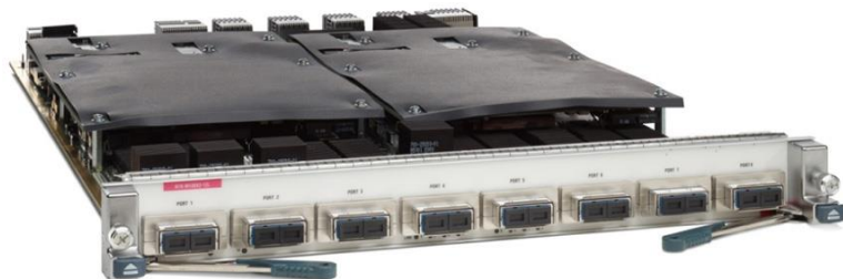
Figure 1. Cisco Nexus 7000 M1-Series 8-Port 10 Gigabit Ethernet Module with XL Option

The Cisco Nexus 7000 Series Switches are a modular data center-class product line designed for highly scalable 10 Gigabit Ethernet networks, with a fabric architecture that scales beyond 15 terabits per second (Tbps), and is designed to support high-density 40 and 100 Gigabit Ethernet deployments. Designed to meet the requirements of the most mission-critical network environments, the switches deliver continuous system operation and virtualized pervasive services. The Cisco Nexus 7000 Series is powered by the proven Cisco ® NX-OS operating system, with enhanced features to deliver real-time system upgrades with exceptional manageability and serviceability. Its innovative unified fabric design is purpose-built to support consolidation of IP, storage, and interprocess communication (IPC) networks on a single Ethernet fabric.