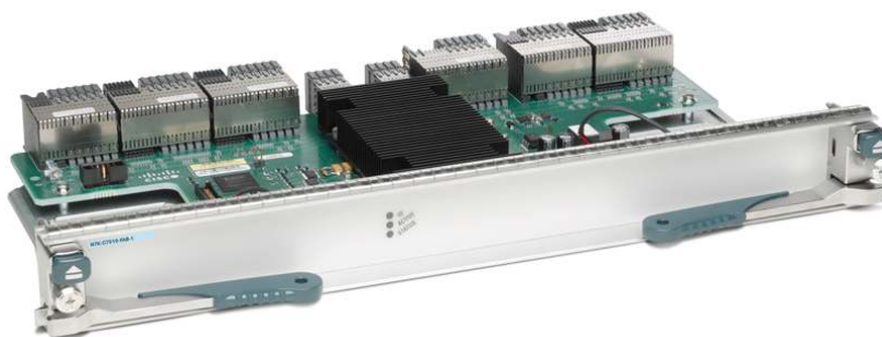
Figure 2. Cisco Nexus 7000 Series 10-Slot Chassis 46-Gbps/Slot Fabric Module

The Cisco Nexus 7000 Supervisor Module (Figure 3) delivers scalable control plane and management functions for the chassis. The fully virtualized and distributed forwarding architecture of the Cisco Nexus 7000 Series performs all data plane processing on the I/O modules, freeing the supervisor to focus exclusively on scaling the control plane. Dual supervisors deliver a fully redundant system that provides high availability and continuous operation even during hardware and software upgrades. The supervisor incorporates an innovative dedicated connectivity management processor (CMP) to support remote management and troubleshooting of the complete system for lights out management.