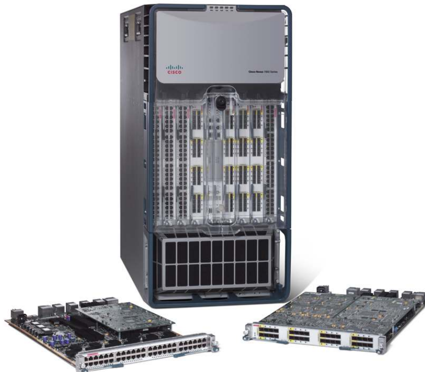
Figure 1. Cisco Nexus 7000 Series 10-Slot Chassis

The first in the next generation of data center–class switch platforms, the Cisco Nexus 7000 Series 10-Slot Chassis (Figure 1) provides modularity, high availability, and integrated resilience specifically for mission-critical data centers.