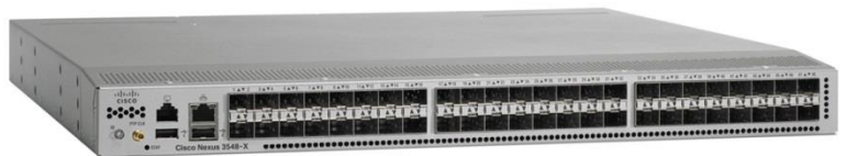
Figure 4. Cisco Nexus 3548-X and 3524-X Switches

The Cisco Nexus 3548-X and 3524-X have the following hardware configuration: