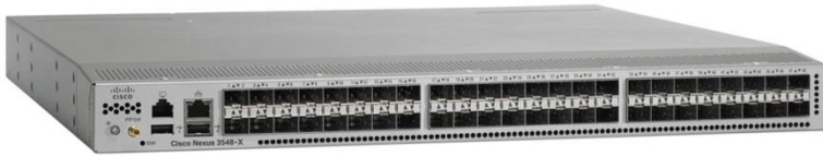
Figure 7. Cisco Nexus 3548-XL and 3524-XL Switch

The Cisco Nexus 3548-XL and 3524-XL have the following hardware configuration: