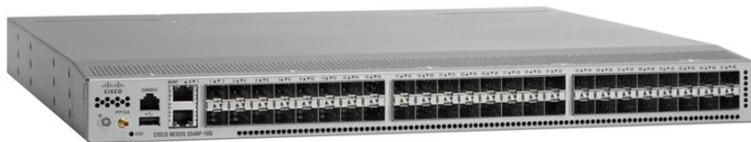
Figure 1. Cisco Nexus 3548 and 3524 Switch

The Cisco Nexus 3548 and 3524 have the following hardware configuration: