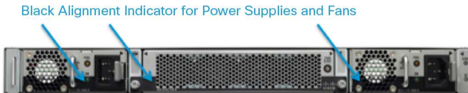
Figure 4. Reversed-Airflow Indicator for the Cisco Nexus 2000 Series

Note that black alignment indicators (Figure 4) on the power supply and fan indicate matching reversed-airflow power supplies and fans. The standard-airflow versions do not have an indicator. If black alignment indicators do not align throughout the fans and power supplies, the power supplies and fans are mismatched.