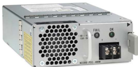
Figure 3. 400W DC Power Supply