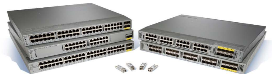
Figure 1. Cisco Nexus 2000 Series Fabric Extenders

Table 1 summarizes the Cisco Nexus 2000 Series products that support a choice of standard or reversed airflow and AC or DC power supply options.