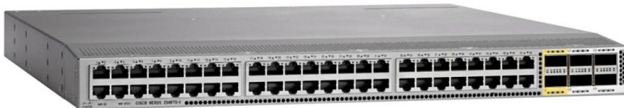
Figure 8. Cisco Nexus 2348TQ-E Fabric Extender (Port View)

Support for both forward (port-side exhaust) and reverse (port-side intake) airflow schemes is available. Forward airflow is useful when the port side of the switch sits on a hot aisle and the power-supply side sits on a cold aisle. Reverse airflow is useful when the power-supply side of the switch sits on a hot aisle and the port side sits on a cold aisle. The Cisco Nexus 2348TQ has two 1+1 redundant hot-swappable power supplies and three hot-swappable independent fans with support for 2+1 redundancy.