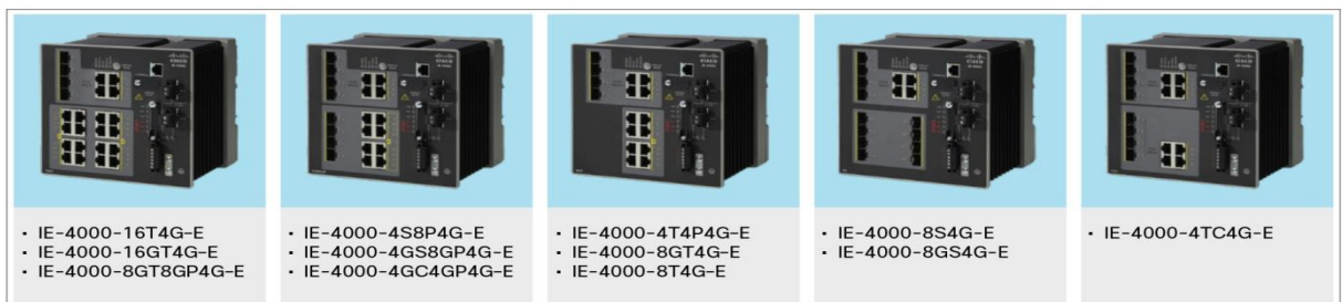
Figure 1. IE 4000 Models

Figure 1 shows switch models, Table 2 shows all the available Cisco IE 4000 Series models, Table 3 lists the SW license PIDs, and Table 4 lists the power supplies for Cisco IE 4000 Series Switches.