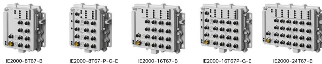
Table 2. Industrial Ethernet 2000 IP67 Series configuration