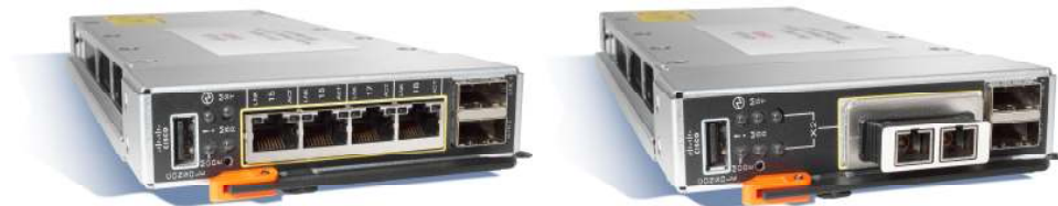
Figure 1. Cisco Catalyst Switch Module 3110 for IBM BladeCenter

The Cisco Catalyst ® Switch Module 3110 for IBM BladeCenter represents the next-generation networking solution for blade server environments. Built from the ground up on the purpose-built Cisco ® hardware and market-leading Cisco IOS ® Software, the Cisco Catalyst Switch Module 3110 (Figure 1) is engineered with unique technologies specifically designed to meet the rigors of blade server-based application infrastructure. Specifically, the switch is designed to deliver scalable, high-performance, highly resilient connectivity while supporting ongoing IT initiatives to reduce server infrastructure complexity and total cost of ownership (TCO).