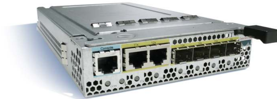
Figure 1. Cisco Catalyst Blade Switch 3030 for Dell

Cisco Systems® is delivering a new technology that brings secure, resilient, and manageable services to the data center server edge. The Cisco® Catalyst® Blade Switch 3030 (Figure 1) is an integrated switch for the Dell™ PowerEdge™ Blade Server Enclosure that extends Cisco network infrastructure services to the server edge and uses existing network equipment to help reduce operational expenses. The Cisco Catalyst Blade Switch 3030 helps ensure consistency across the network for advanced services such as security and resiliency. It also allows customers to take advantage of an end-to-end Cisco management framework to simplify ongoing operations.