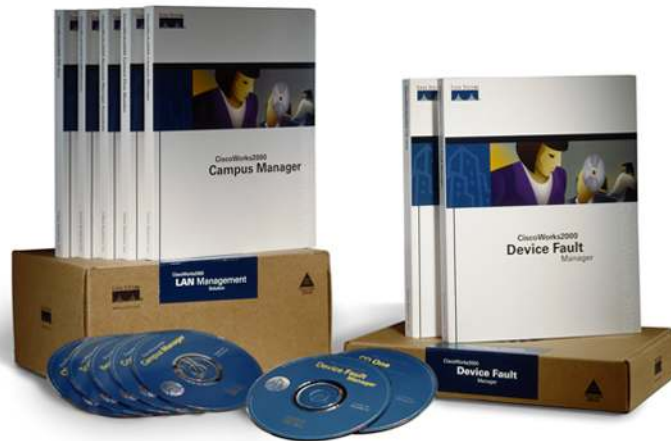
Figure 2. CiscoWorks LAN Management Solution

The Cisco Catalyst Blade Switch 3030 uses CiscoWorks, the same management framework, that controls Cisco products throughout data center and enterprise networks. CiscoWorks LAN Management Solution (Figure 2), the preferred management tool for enterprise switch platforms, can now be used to manage data center networks all the way to the server edge. The added benefits of security, resiliency, manageability, and end-to-end services deployment provide compelling operational and business benefits.