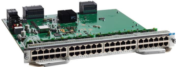
Figure 1. C9400-LC-48U Cisco Catalyst 9400 Series 48-Port UPoE 10/100/1000 (RJ-45)

The UPoE line card supports PoE, PoE+, and Cisco Universal PoE to deliver 15W, 30W or 60W to the access point. 60W of in-line power can be used to power more devices—including IP phones, IPTVs, surveillance cameras, virtual desktop clients, and many others—without having to install extra wall or ceiling circuits while taking advantage of advanced power management capabilities such as Cisco EnergyWise®.