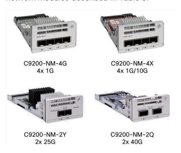
Figure 2 . Cisco Catalyst 9200 Series Switch network modules

Cisco Catalyst 9200 Series switches come with modular or fixed uplinks as indicated in Table 1. With modular SKUs, the field-replaceable network modules provide infrastructure investment protection by allowing a nondisruptive migration from 1G to 10G and beyond. When you purchase the switch, you can choose from the network modules described in Table 3.