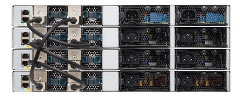
Figure 4. Cisco Catalyst 9200 Series Switch stacked units