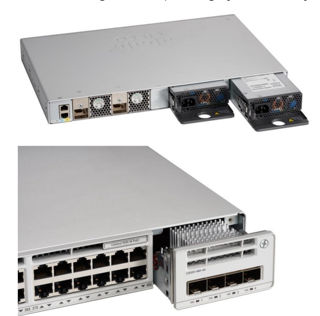
Figure 3. Cisco Catalyst 9200 Series Switch dual redundant power supplies

Table 4 lists the PoE power availability for each model.