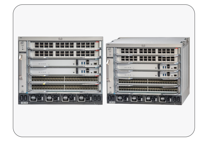
Figure 5. Catalyst 9600 Series

the first network silicon to offer switching capacity up to 25.6 Tbps (12.8 Tbps full-duplex) in the enterprise. The Q200 ASIC offers high-performance along with full routing and switching capabilities without external memories. This is enabled by a multiple slice (discreet processing pipeline) internal architecture that includes an on-chip 2.5D High Bandwidth Memory (HBM). The Catalyst 9600 Series leverages a high-performance multiple core x86 CPU, and is Cisco's leading purposebuilt modular core and WAN edge services enterprise switching platform, built for security, loT, and cloud.