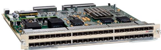
Figure 2. 48-Port 10/100/1000 Copper Module