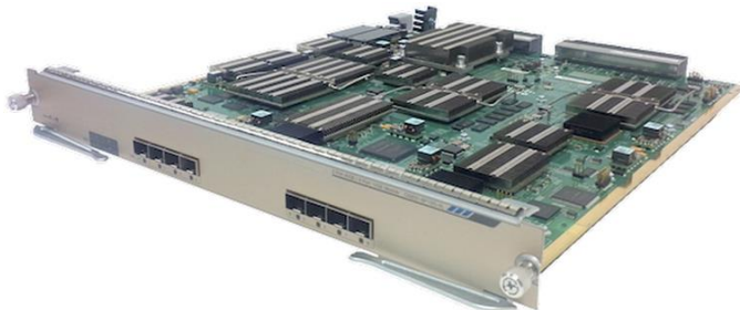
Figure 3. 6800 Series 8-Port 10-Gigabit Ethernet Fiber Module

The C6800 Family 8-port 10-Gigabit Ethernet Fiber module provides up to 40 10-Gigabit Ethernet fiber ports in a single Cisco Catalyst 6807-XL Switch chassis, or up to 80 10-Gigabit Ethernet fiber ports in a Cisco Catalyst 6807-XL Virtual Switching System (VSS) 2T. It also provides up to 88 10-Gigabit Ethernet fiber ports in a single Cisco Catalyst 6513-E Switch chassis or up to 176 10-Gigabit Ethernet fiber ports in a Cisco Catalyst 6500 Virtual Switching System (VSS) 2T.