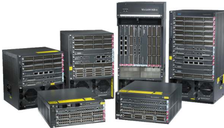
Figure 1. Cisco Catalyst 6500 Series with Cisco IOS Software Modularity

The Catalyst 6500 Series delivers hardware-based forwarding through Application-Specific Integrated Circuits (ASICs) on a central Policy Feature Card (PFC) or Distributed Forwarding Cards (DFC). The control plane functions on the Catalyst 6500 Series run on dedicated CPUs on the Multilayer Switch Forwarding Card (MSFC) complex.