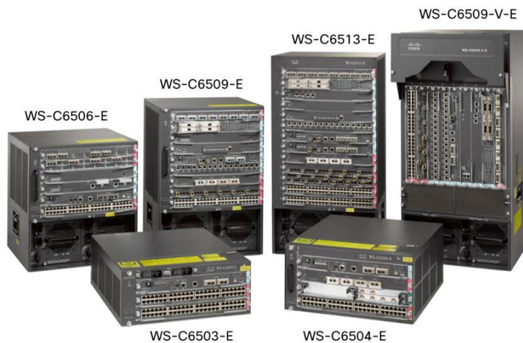
Figure 1. Cisco Catalyst 6500-E Series Chassis

The Cisco Catalyst 6500-E Series Chassis provides superior investment protection by supporting multiple generations of products in the same chassis, lowering the total cost of ownership. The Cisco Catalyst 6500-E Series Chassis (Figure 1) supports all the Cisco Catalyst 6500 Supervisor Engines up to and including the Cisco Catalyst 6500 Series Supervisor Engine 2T, and associated LAN, WAN, and services modules.