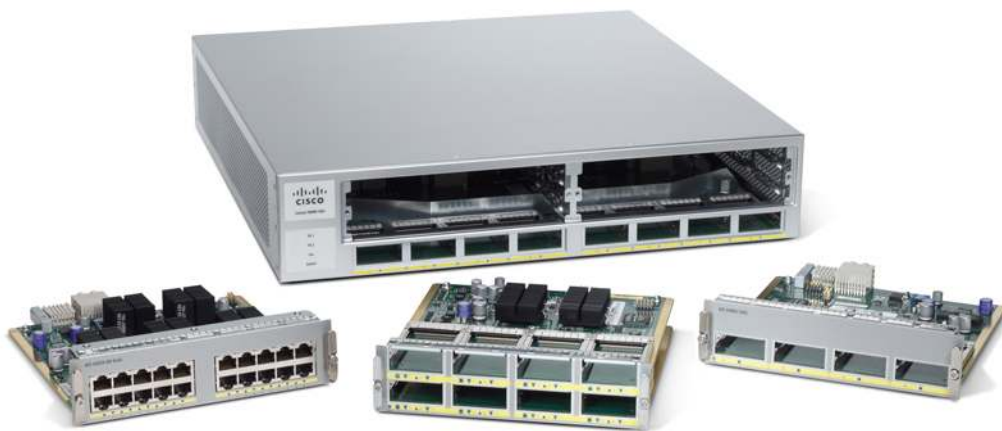
Figure 1. Cisco Catalyst 4900M

The Cisco Catalyst 4900M half cards provide a wide variety of combinations of Gigabit Ethernet and 10 Gigabit Ethernet media types. The base unit can accommodate up to two of following half cards in any combination: