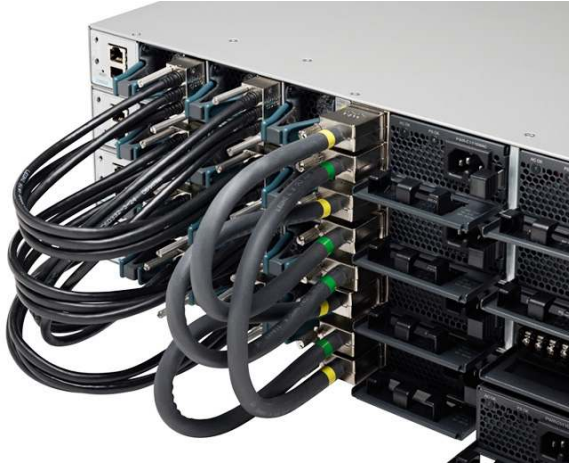
Figure 2. StackWise-480 and StackPower Connectors

StackPower can be deployed in either power-sharing mode or redundancy mode. In power-sharing mode, the power of all the power supplies in the stack is aggregated and distributed among the switches in the stack. In redundant mode, when the total power budget of the stack is calculated, the wattage of the largest power supply is not included. That power is held in reserve and used to maintain power to switches and attached devices when one power supply fails, enabling the network to operate without interruption. Following the failure of one power supply, the StackPower mode becomes power sharing.