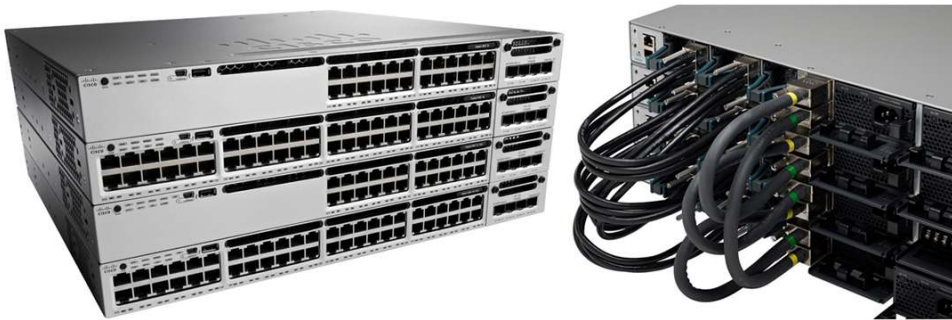
Figure 3. Cisco Catalyst 3850 Series Switches

Table 1 shows the Cisco Catalyst 3850 Series configurations.