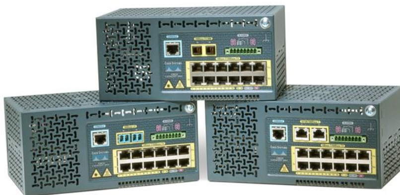
Table 1. Product Features and Benefits