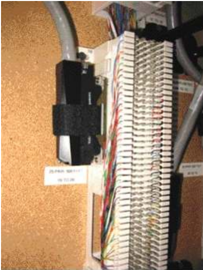
Figure 2. Block 66

The breakout box is generally used when testing or demonstrating LRE. It terminates the RJ-21 cable and “splits” the 24 pairs into 24 RJ-11 Connections (standard U.S. telephone jack). The Graybar part number for this item is AT125-SM.