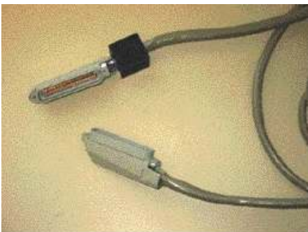
Figure 1. RJ-21 Cable

At the other end of the RJ-21 cable, you will need to attach a POTS splitter, a block 66 (Figure 2), or a breakout box (Figure 3). The block 66 is a standard punch block used in telecommunications applications. The RJ-21 cable connects to the side of the block, and the 24 pairs it contains are terminated on vampire clips. The block 66 is used to cross-connect pairs (loops).