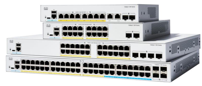
Figure 2. Cisco Catalyst 1300 Series switches

The Cisco Catalyst 1300 Series Switches are fixed, managed, enterprise-class Gigabit Ethernet Layer 3 switches designed for small and medium-sized business and branch offices. These simple, flexible, and secure switches are ideal for deployment out of the wiring closet. The Catalyst 1300 Series operates on customized Linux OS software, with an intuitive dashboard that simplifies network setup and advanced features that accelerate digital transformation, while pervasive security protects business-critical transactions. The 1300 Series switches provide the ideal combination of affordability and capabilities for small and medium-sized businesses and help you create a more efficient, better-connected workforce. When your business needs advanced networking features and security for the digital transformation, yet value is still a top consideration, you're ready for the Cisco Catalyst 1300 Series Switches.