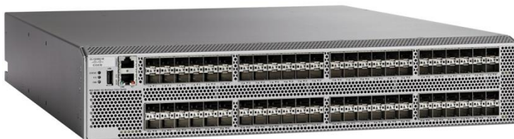
Figure 1. Cisco MDS 9396S 16G Multilayer Fabric Switch

The Cisco MDS 9396S is powered by Cisco NX-OS Software and Cisco Prime™ Data Center Network Manager (DCNM) software. It delivers advanced storage networking features and functions with ease of management and compatibility with the entire Cisco MDS 9000 Family portfolio for reliable end-to-end connectivity.