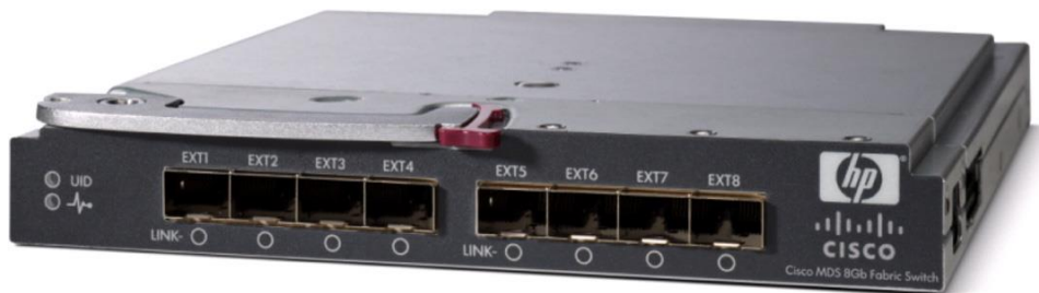
Figure 1. Cisco MDS 8G Fibre Channel Blade Switch for HP c-Class BladeSystem