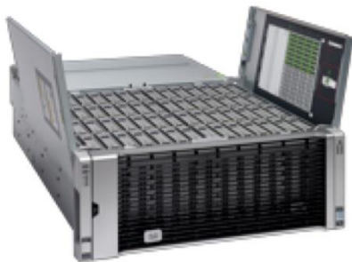
Figure 1. Cisco UCS S3260 Storage Server

The Cisco UCS S3260 helps you achieve the highest levels of data availability and performance. With dual-node capability that is based on the Intel ® Xeon ® processor E5-2600 v4 series, it features up to 600 terabytes (TB) of local storage in a compact 4-rack-unit (4RU) form factor. The drives can be configured with enterprise-class Redundant Array of Independent Disks (RAID) redundancy or with JBOD architecture in pass-through mode. Network connectivity is provided with dual-port 40-Gbps nodes in each server, with expanded unified I/O capabilities for data migration between network-attached storage (NAS) and SAN environments. This storage-optimized server comfortably fits in a standard 32-inch-depth rack, such as the Cisco ® R 42610 Rack.