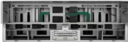
Figure 2. Cisco UCS S3260 (Empty Chassis)