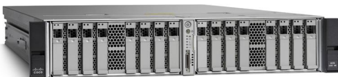
Figure 1. Cisco UCS C420 M3 Rack Server