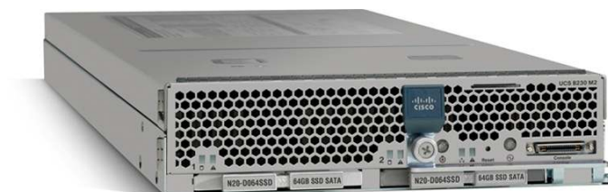
Figure 1. Cisco UCS B230 M2 Blade Server

The Cisco UCS B230 M2 is a half-width blade (Figure 1). Up to eight of these high-density two-socket servers can reside in the six-rack-unit (6RU) Cisco UCS 5100 Series Blade Server Chassis, offering one of the highest densities of servers per rack unit in the industry.