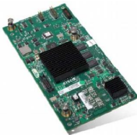
Figure 1. Cisco UCS M81KR Virtual Interface Card

A Cisco® innovation, the Cisco UCS M81KR Virtual Interface Card (VIC) is a virtualization-optimized Fibre Channel over Ethernet (FCoE) mezzanine card designed for use with Cisco UCS B-Series Blade Servers (Figure 1). The VIC is a dual-port 10 Gigabit Ethernet mezzanine card that supports up to 128 Peripheral Component Interconnect Express (PCIe) standards-compliant virtual interfaces that can be dynamically configured so that both their interface type (network interface card [NIC] or host bus adapter [HBA]) and identity (MAC address and worldwide name [WWN]) are established using just-in-time provisioning. In addition, the Cisco UCS M81KR supports Cisco VN-Link technology, which adds server-virtualization intelligence to the network.