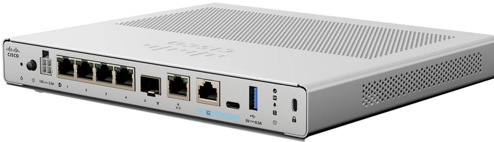
Figure 1. 3D view of the Cisco Secure Firewall 220 model