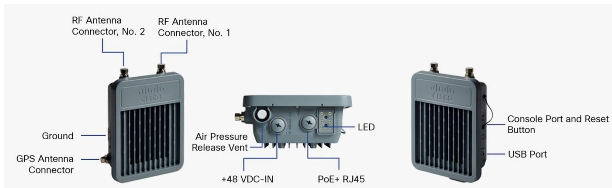
Figure 2. Product interfaces and features