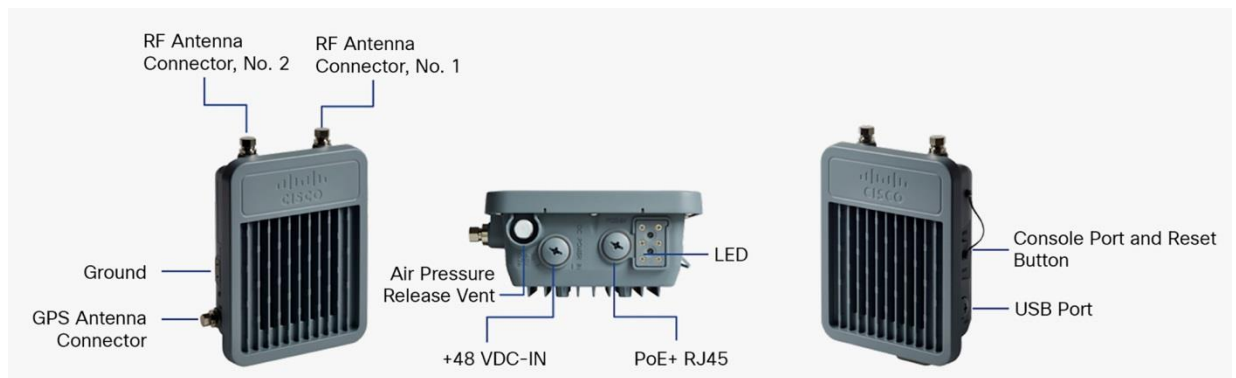
Figure 2. Product interfaces and features