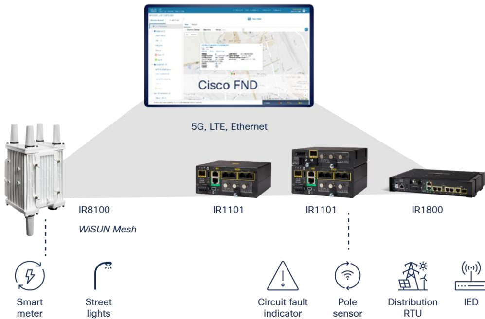
Figure 2. Multiservice field area network and IoT FND in the head end