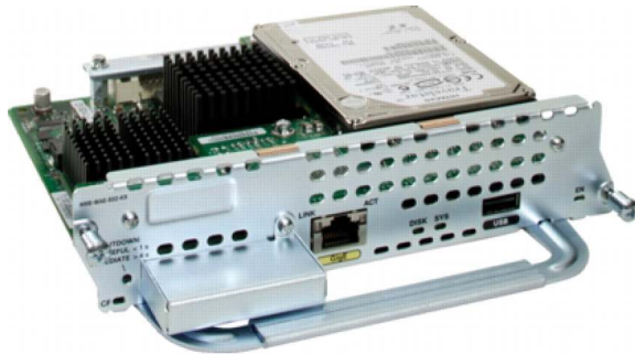
Figure 2. Cisco WAAS NME