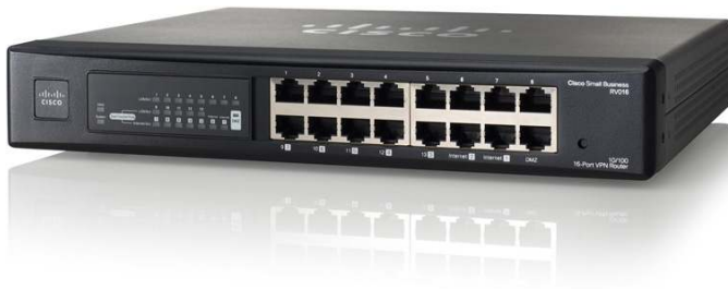
Figure 1. Cisco RV016 Multi-WAN VPN Router

To further safeguard your network and data, the Cisco RV016 includes business-class security features and optional cloud-based web filtering. Configuration is a snap, using an intuitive, browser-based device manager and setup wizards.