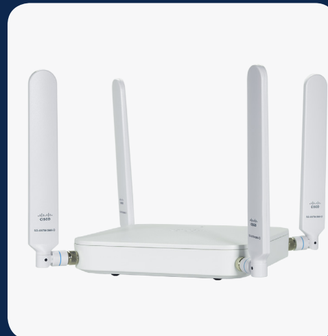
Figure 1. The Cisco Catalyst Cellular Gateway

Over the last 10 years, we've seen the evolution of 4G. First LTE, then LTE Advanced and LTE Advanced Pro. And now 5G. The higher throughput and lower latency of 5G means increased workforce productivity and a better user experience. Now you can support more users in more locations, using cellular to offer wireless connectivity with wider reach. The ability to support new applications and connect more devices makes it easier to migrate to a wireless WAN (WWAN) with guaranteed quality of experience. Cisco is working to make the transition to 5G easy by building technologies such as the Cisco® Catalyst® Cellular Gateways that allow for a seamless cellular upgrade.