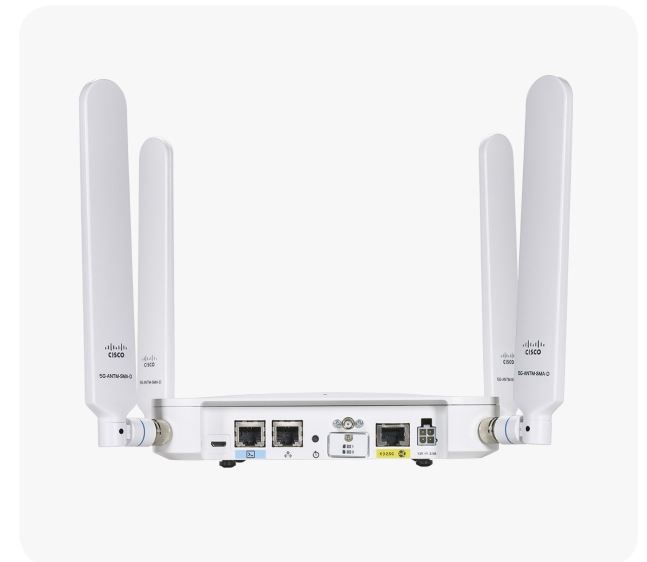
Figure 2. Port Density in the Cisco Cellular Gateway