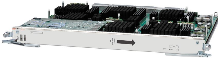
Figure 2. Cisco CRS-3 Label Switch Processor

The Cisco CRS-3 Label Switch Processor main features include: