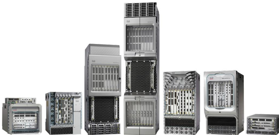
Figure 1. Cisco ASR 9000 System

The Cisco ASR 9000 Series is an operationally simple, future-optimized platform using next-generation hardware and software. The following are highlights of this next-generation platform: