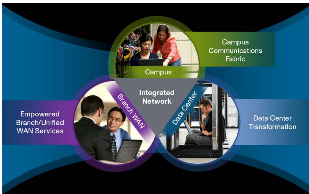
Figure 1. Places in the Network, and Their Associated Solution Blueprints

Cisco has developed a series of solution blueprints based on this architectural design approach, including: