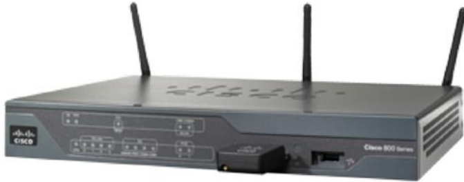
Figure 1. Cisco 880G Series 3G Wireless Integrated Services Routers

With enhanced data rates and improved latency (below 100 milliseconds), WWAN services are an ideal way to supplement traditional wire line services. 3G WWAN data services offered today have average data rates well in excess of ISDN speeds, with theoretical limits in excess of 7 Mbps on the downlink and 5 Mbps on the uplink. The 3G WWAN can be use as a primary link for sites with lower bandwidth requirements and for mobile applications. The 3G WWAN data services can also be use as a cost-effective alternative in areas where broadband services are either not available or very expensive. Cisco is building on these performance milestones and adding support for wireless to our wide variety of WAN interface alternatives.