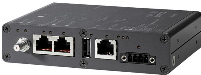
Figure 1. Cisco IR500

Figure 1 displays a Cisco WPAN Industrial Router.