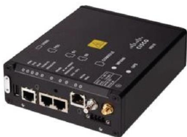
Figure 1. Cisco IR510

Figure 1 displays a Cisco WPAN Industrial Router IR510.