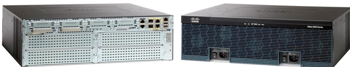
Figure 1. Cisco 3900 Series Integrated Services Routers

Cisco® 3900 Series Integrated Services Routers build on 25 years of Cisco innovation and product leadership. The new Cisco Integrated Services Routers Generation 2 (ISR G2) platforms are architected to enable the next phase of branch-office evolution, providing rich-media collaboration and virtualization to the branch office while maximizing operational cost savings. The new routers support new high-capacity digital signal processors (DSPs) for future enhanced video capabilities, high-powered service modules with improved availability, multicore CPUs, Gigabit Ethernet switching with Cisco Enhanced Power over Ethernet (ePoE), and new energy visibility and control capabilities while enhancing overall system performance. Additionally, a new Cisco IOS® Software Universal image and Cisco Services Ready Engine (SRE)® module enable you to decouple the deployment of hardware and software, providing a flexible technology foundation that can quickly adapt to evolving network requirements. Overall, the Cisco 3900 Series offers exceptional total cost of ownership (TCO) savings and network agility through the intelligent integration of market-leading security, unified communications, wireless, and application services.