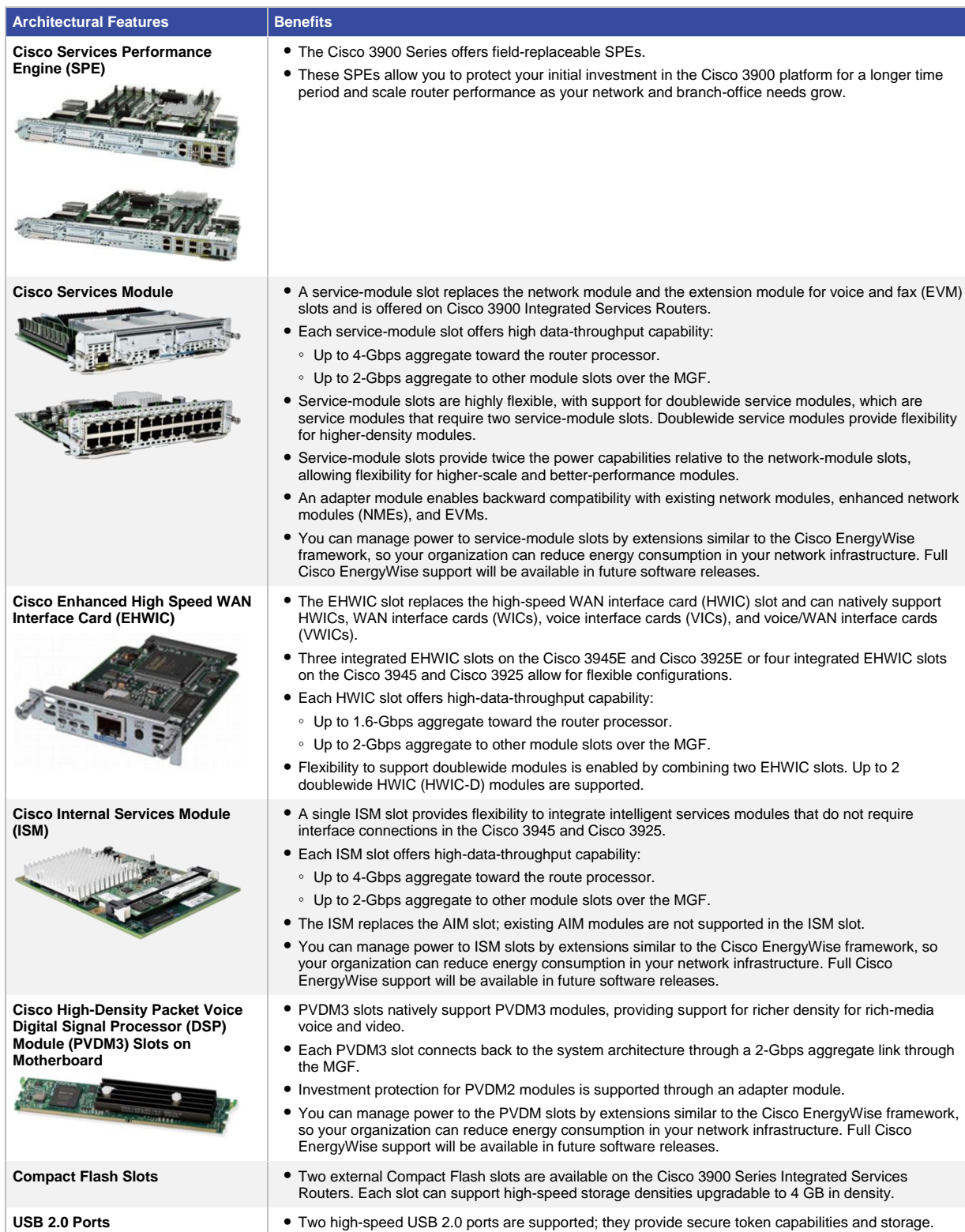
Table 3. Modularity Features and Benefits