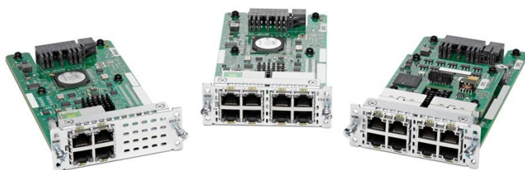
Figure 1. 4-Port, 8-Port, and 8-Port PoE/PoE+ Cisco Gigabit Ethernet LAN Switch Network Interface Modules

The new features for the Gigabit Ethernet LAN Switch NIMs include four quality-of-service (QoS) queues per port, Shaped Deficit Weighted Round Robin (SDWRR), dynamic secure port, intra chassis cascading, up to 30W of PoE/PoE+ per port, and PoE per-port monitoring and policing.