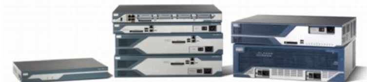
Figure 1. Cisco Integrated Services Routers

The Cisco® Integrated Services Router is the ideal platform for delivering video services in enterprise branch offices, commercial offices, and small or medium-sized business offices. Video services on the integrated services router platforms consists of video-enabled Cisco Unified CallManager Express, Cisco Unified Survivable Remote Site Telephony with Integrated ISDN Video Gateway, and Cisco Video Session Border Controller. Through the integration of security, video gateway, and call-processing capabilities, Cisco Integrated Services Router platforms deliver a complete office video services solution (Figure 1).